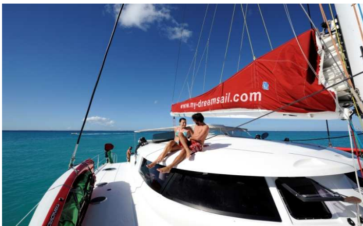
Passengers on the bow