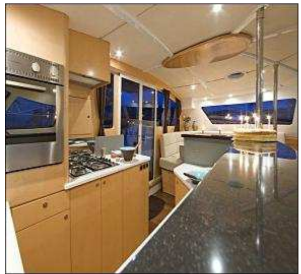
Bar & Kitchen