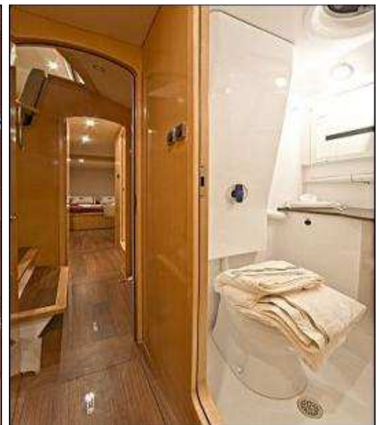
Double cabin with ensuite bathroom